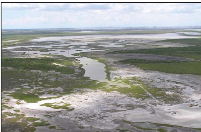
The Nueces Delta Preserve includes mud flats, pothole wetlands, marsh, bay and river habitats.

The Nueces Delta Preserve is located on the former McGregor Ranch. Its site includes the Rincon Bayou, a vital link in the riparian habitat, and a significant freshwater inflow route from Nueces River into Nueces Bay. The area also has uplands, river and bay shoreline. This makes it